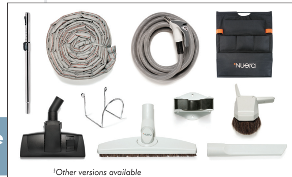
†Other versions available